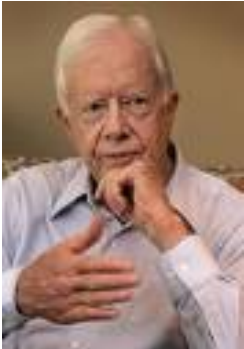
Former President Jimmy Carter

VIOLET, La. -- Former President Jimmy Carter said the insurance crisis along the Gulf Coast is wiping out much of the benefit that humanitarian organizations are trying to provide to victims of the devastating 2005 hurricane season.